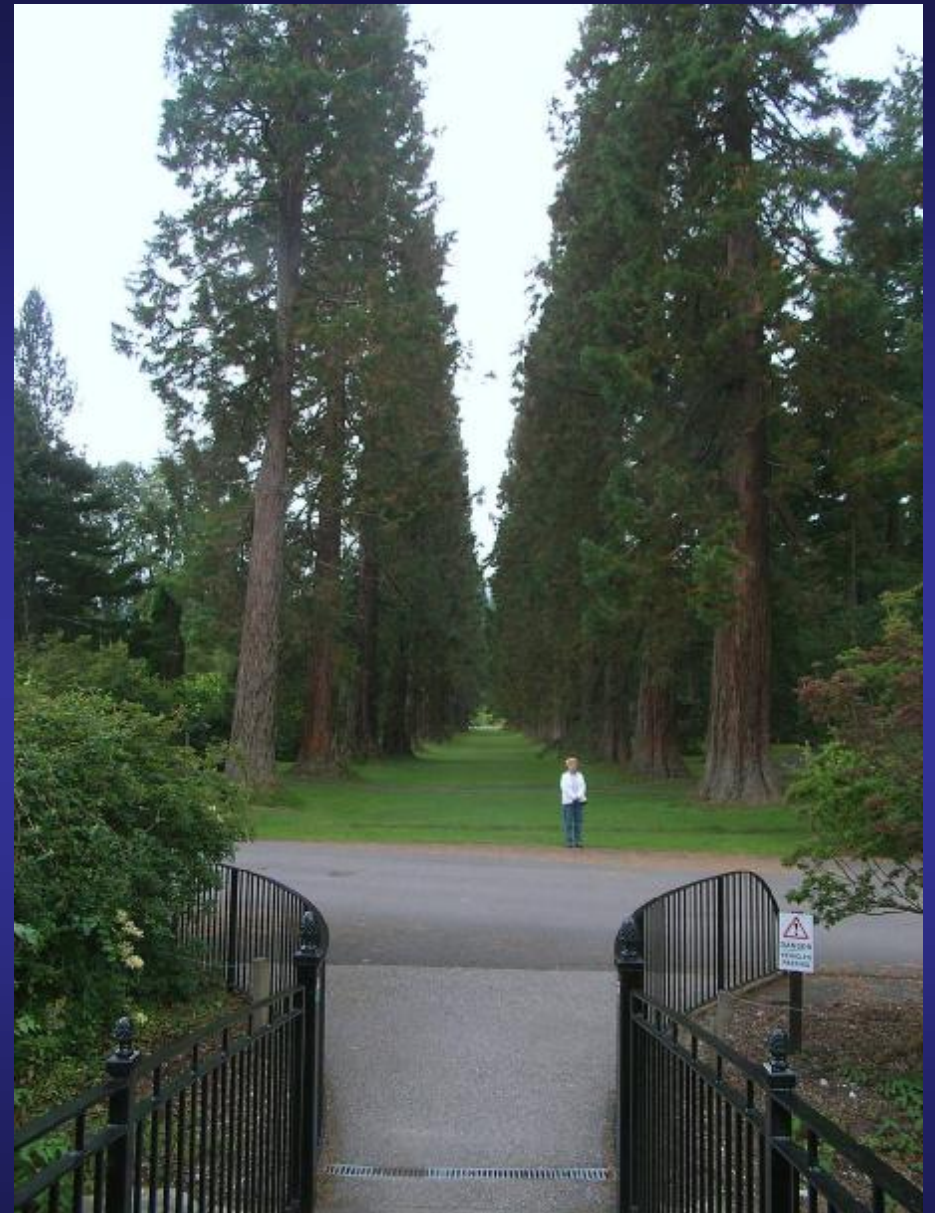
Piers Patrick's giant redwood avenue planted in 1863