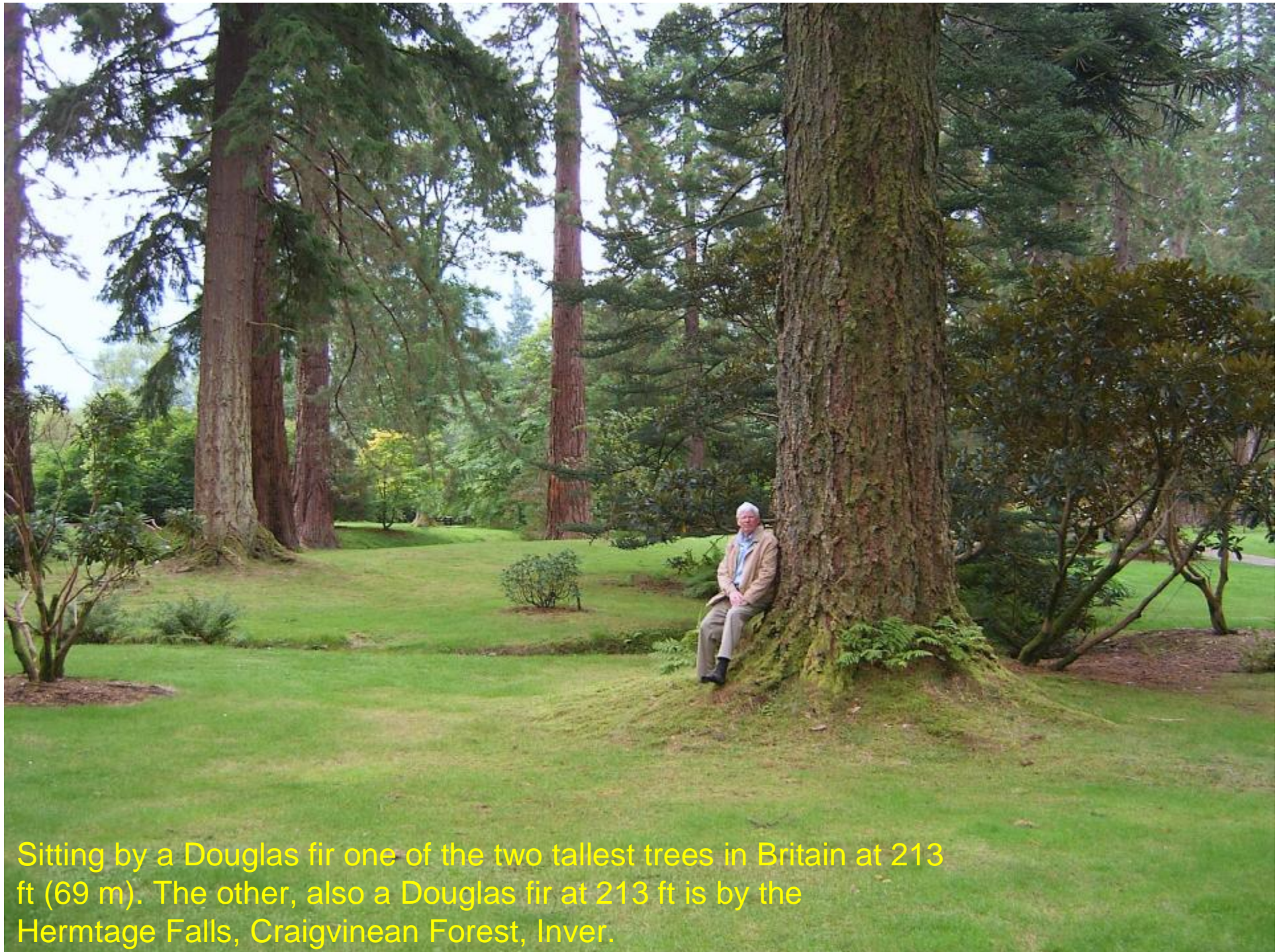
Sitting by a Douglas fir one of the two tallest trees in Britain at 213 ft (69 m). The other, also a Douglas fir at 213 ft is by the Hermtage Falls, Craigvinean Forest, Inver.