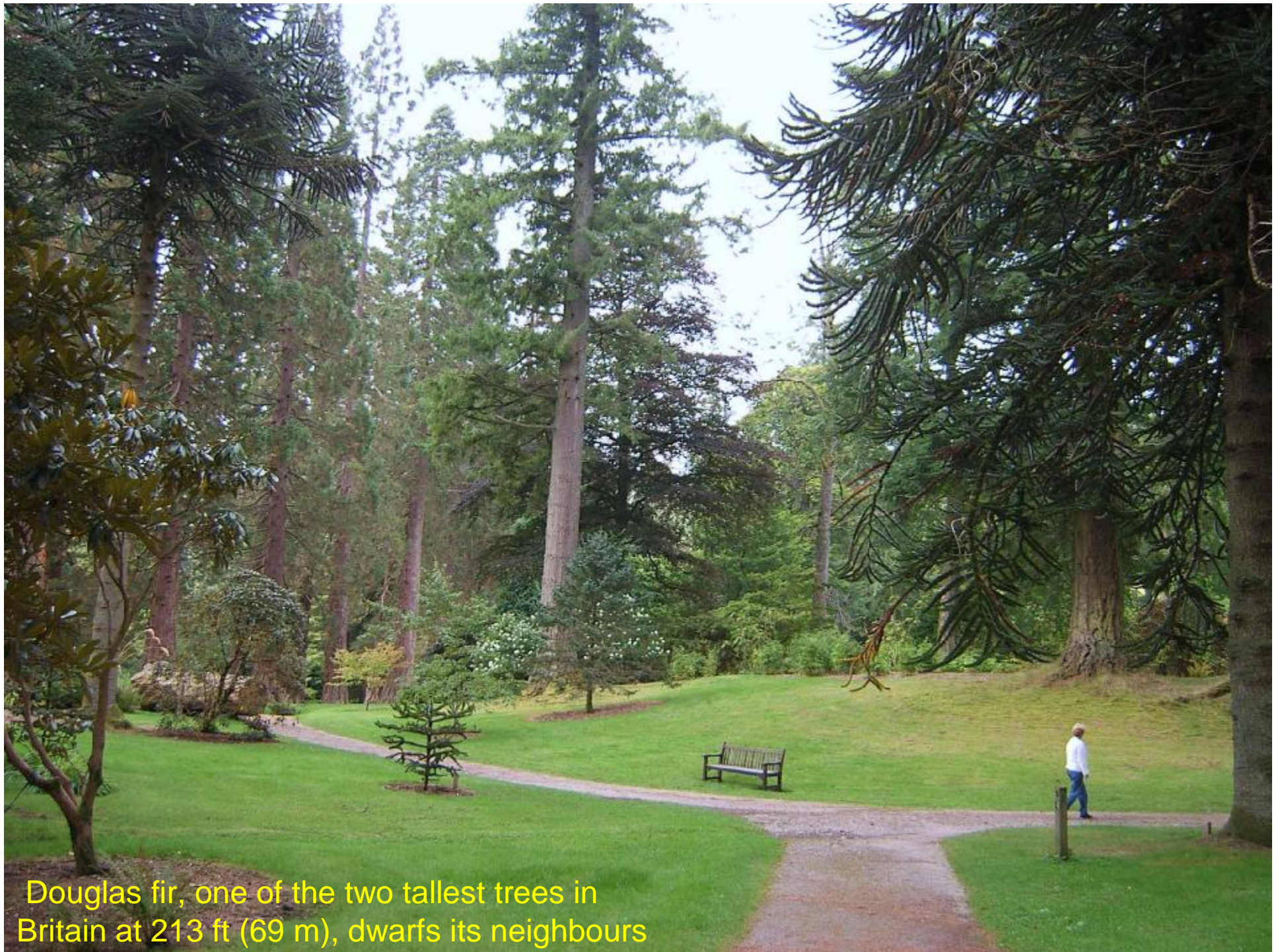
Douglas fir, one of the two tallest trees in Britain at 213 ft (69 m), dwarfs its neighbours